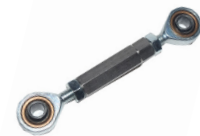
Connecting Rod Assys Magnetic rod assembly to open/close bus doors