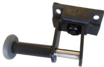
U bracket assembly for wheelchairs 113314