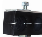
Cable Clamp Cable clamp for under carriage of buses