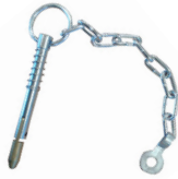
Steel sword pin + chain M10x119 zincplated with brass pin head P816001-18