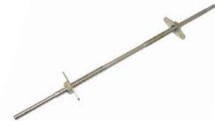
Adjustment pole for a chair's back side B6363-42