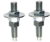
Mounting for a boat engine 97641600961W3N