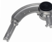
Knee Hinge Level adjuster for a wheelchair to keep the leg straight or bent