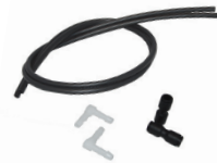
Soft pipe E2006-1159