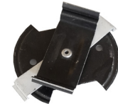
Single egg carrier 114521