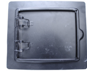
Fuel Filler Flap for Bus W823001-2