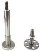
Foot of a locker room to adjust the height 976SCHWEISSBA212059V