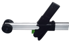
Anti Tipper Tilt protection for wheelchair