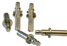
Used for chainsaws to adjust the amount of lubrication H30444-428