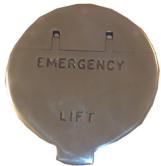
Emergency flap, polished aluminium P816001-34