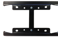
Moveable aluminium support bracket for BUS V122028-66