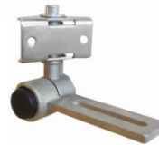
Calf support assy for wheelchairs 113356