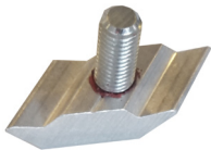
Bus chair bolt 113710