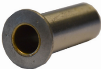
Detail is weld into the mechanical, can be used to two different models K7710-112