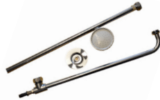
Parts to a shower roof 02185-701