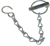
Assembled lynch pin with victor chain and S-hook S919004-141