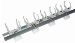
Egg carrier Transporting, arranging and line up eggs