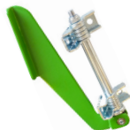
Lockable hinge for wheelchairs 121112