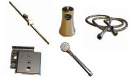
Shower set 02185-757