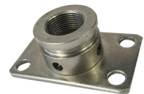
Oil sump for a truck L38051-49