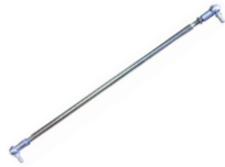
Door pullrod to open/close doorsystems V122028-56