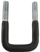
Steel M10 U Bolt with rubber coating A3728-01