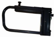
Forklift mount safetydoor fully assembled M0061000374