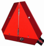
Forklift read end safety triangle M5171000040