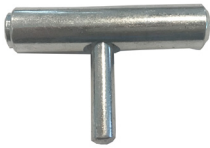
Cable Clamp Cable clamp for under carriage of buses