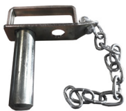
Piston rod assembly