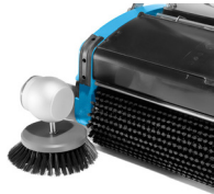
Controls the side brushes of the machine of floor cleaning 3267-1Y19905